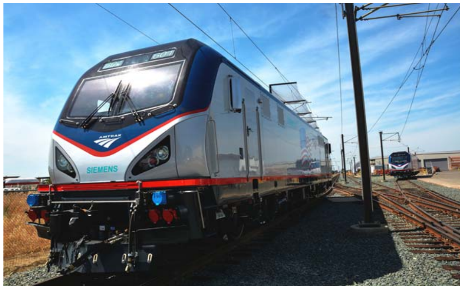
Figure 1. Amtrak's New ACS-64 Locomotive