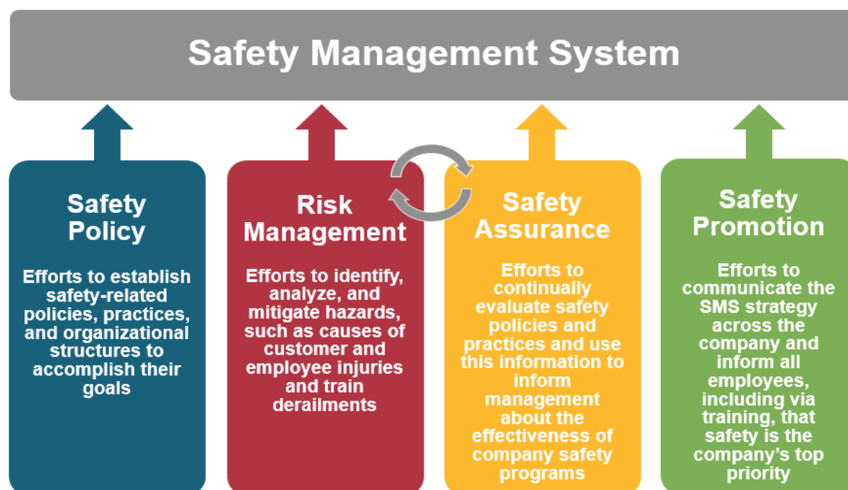
Figure 1. SMS Four Lines of Effort

The program consists of four interconnected lines of effort, as Figure 1 shows.