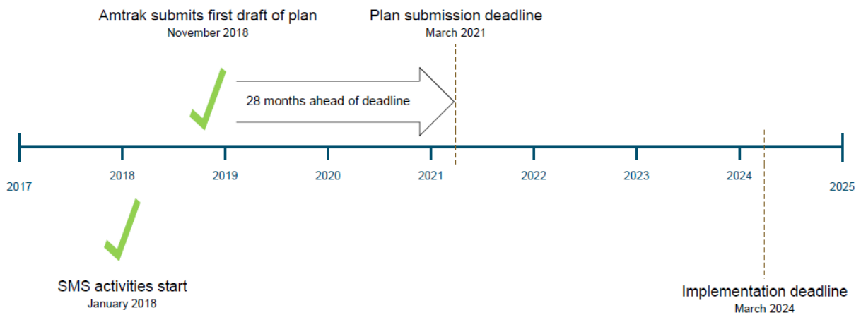
Figure 2. Company Actions Compared to FRA Deadlines a