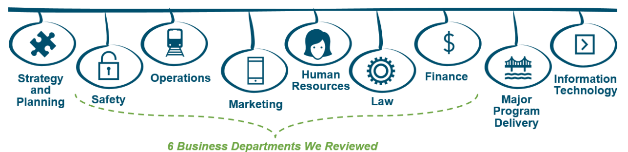
Figure 1. Company Departments as of November 2021